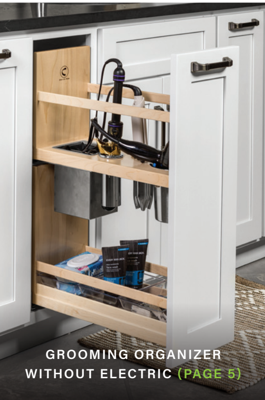
GROOMING ORGANIZER WITHOUT ELECTRIC (PAGE 5)