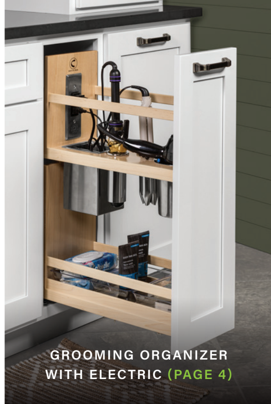
GROOMING ORGANIZER WITH ELECTRIC (PAGE 4)