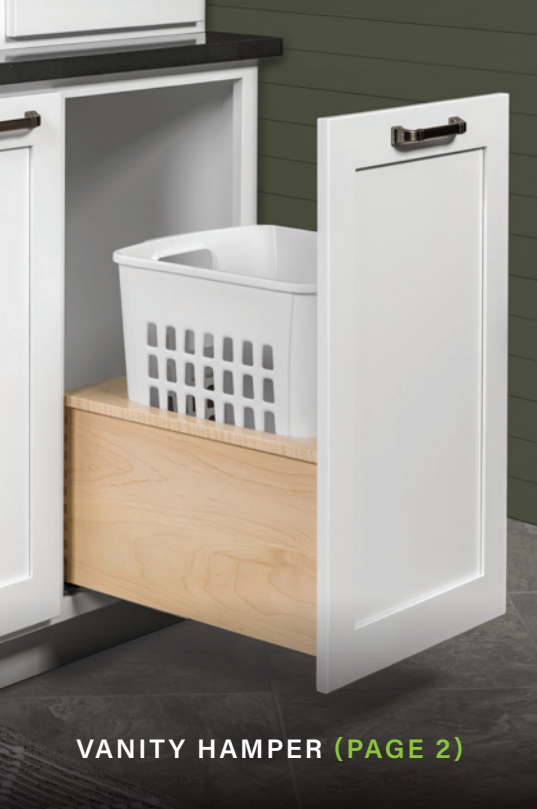
VANITY HAMPER (PAGE 2)