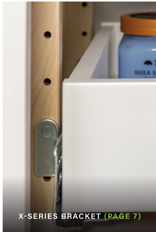
X-SERIES BRACKET (PAGE 7)