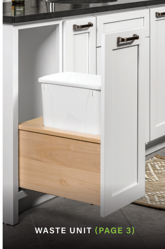
WASTE UNIT (PAGE 3)