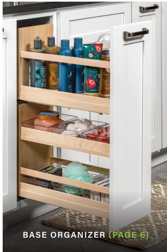
BASE ORGANIZER (PAGE 6)